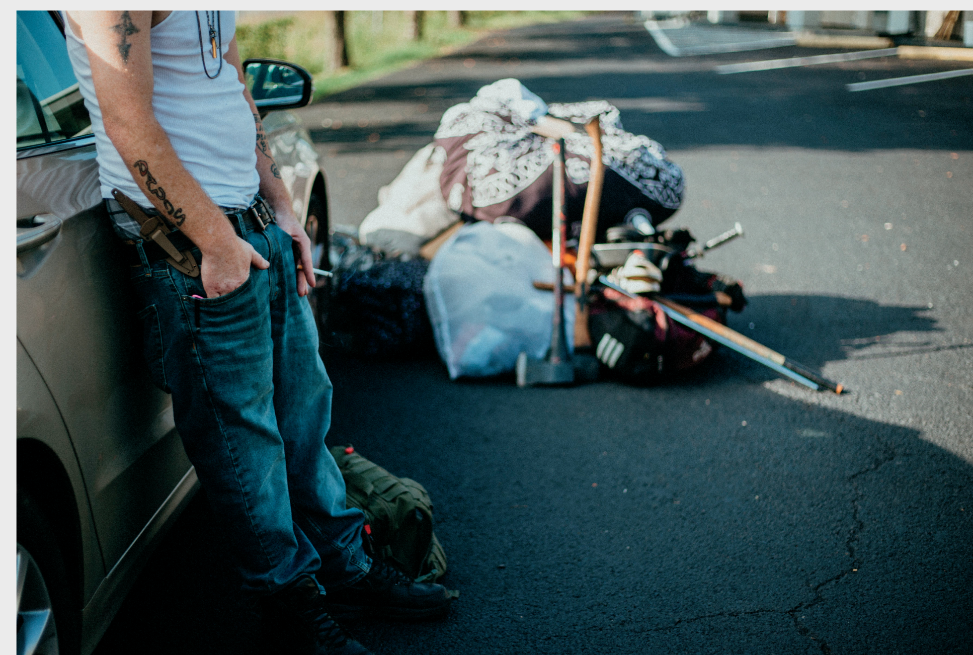
MOVE OUT DAY VERONA, VA