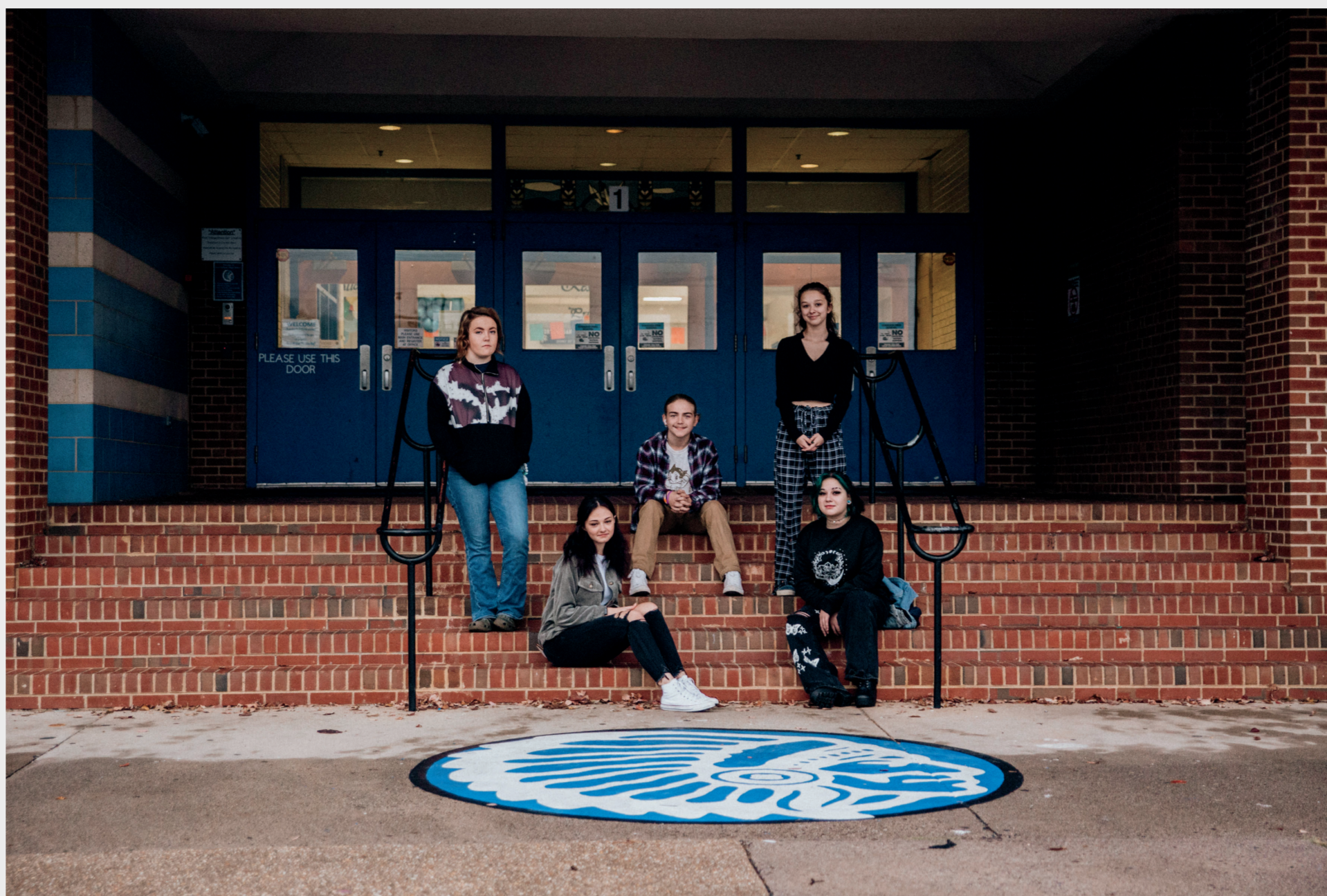
YOU'D NEVER KNOW IT FORT DEFIANCE, VA