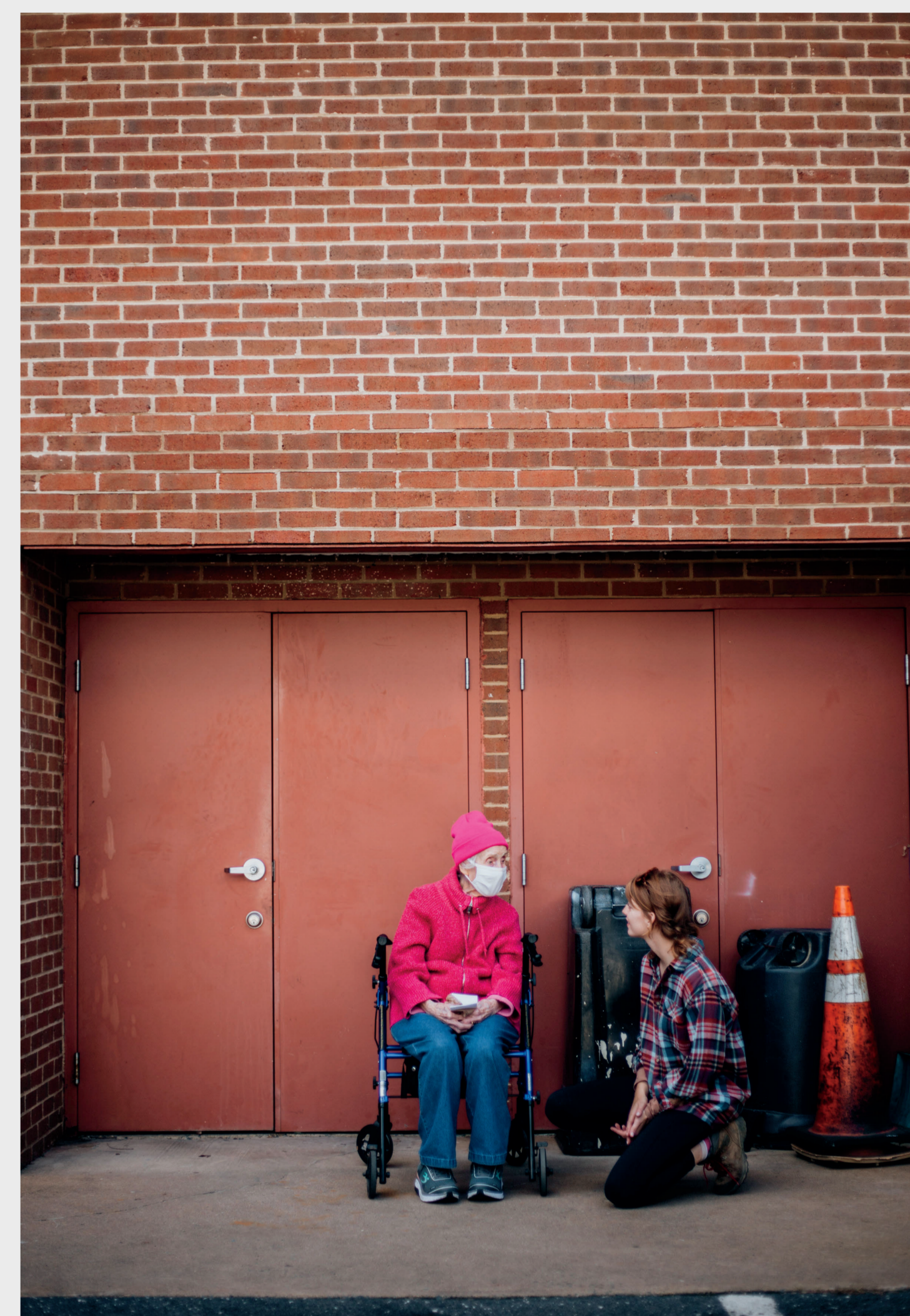
GESTURES OF COMPASSION STAUNTON, VA