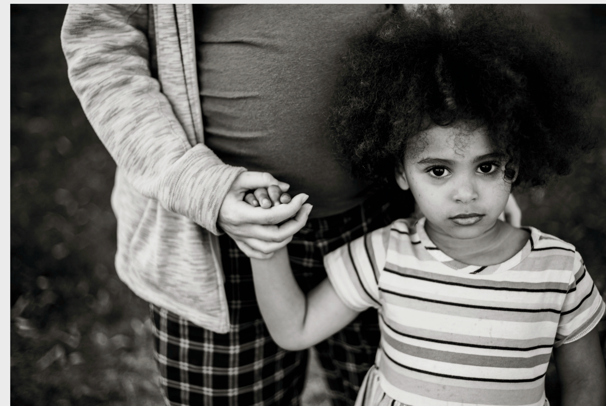
BREAKING THE CYCLE WAYNESBORO, VA