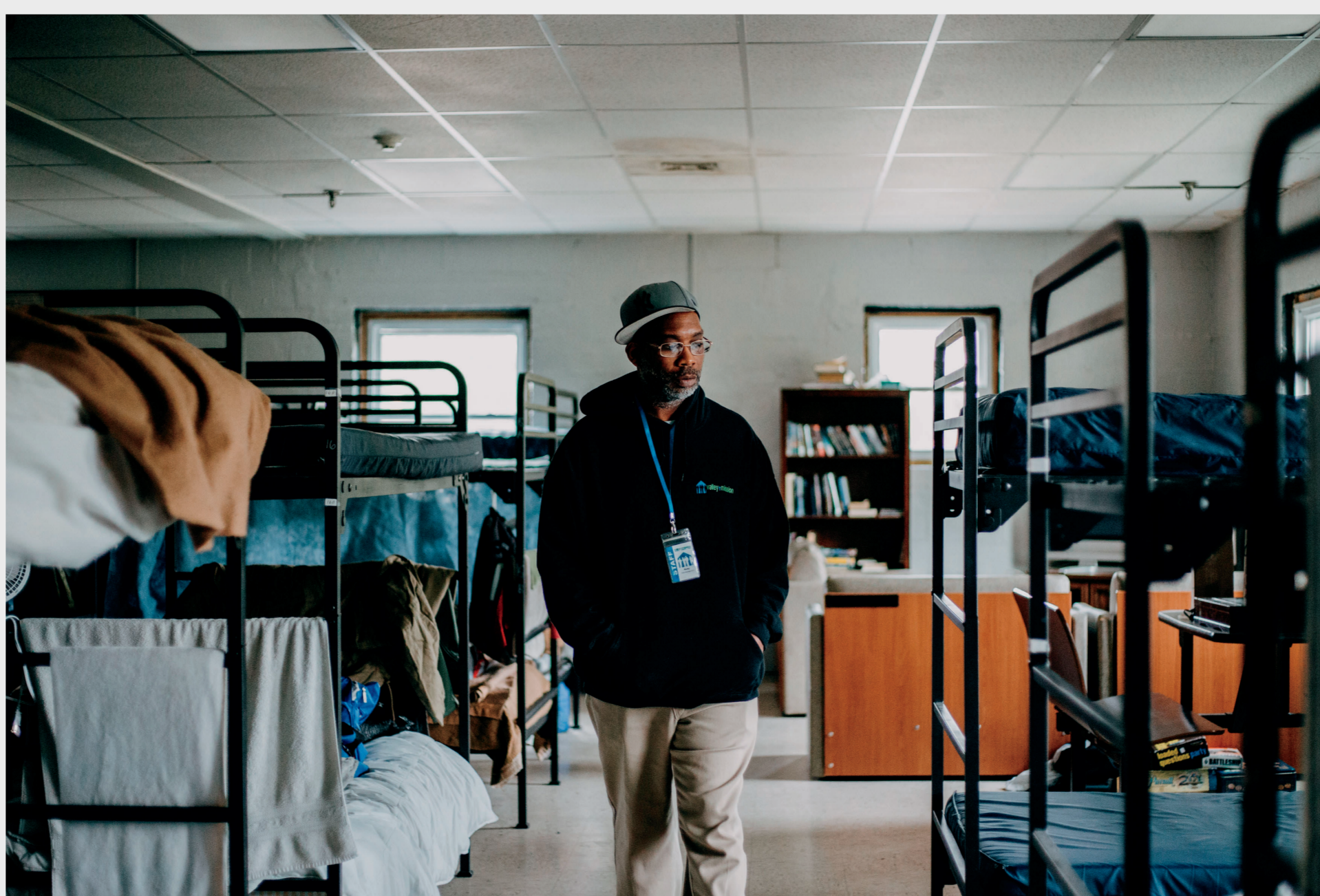
THE SAFETY NET STAUNTON, VA