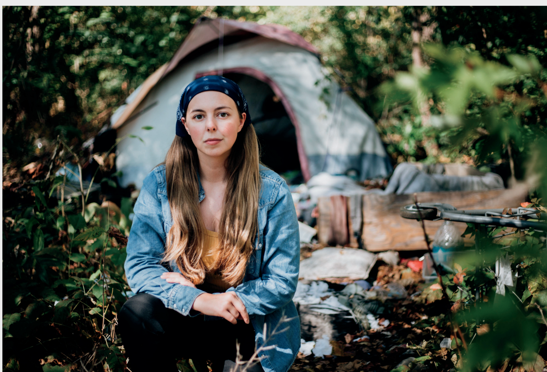
ASKING THE RIGHT QUESTIONS FISHERSVILLE, VA