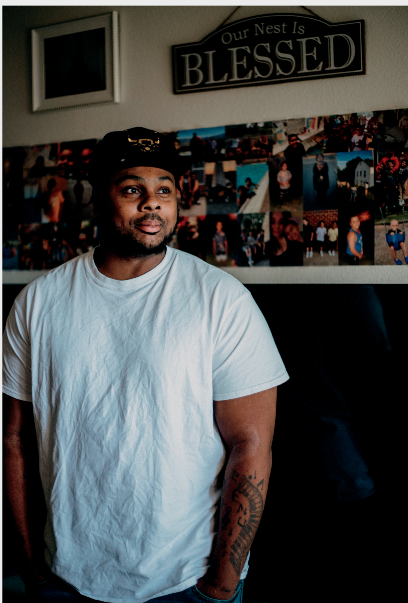
OVERCOMING STIGMAS STAUNTON, VA