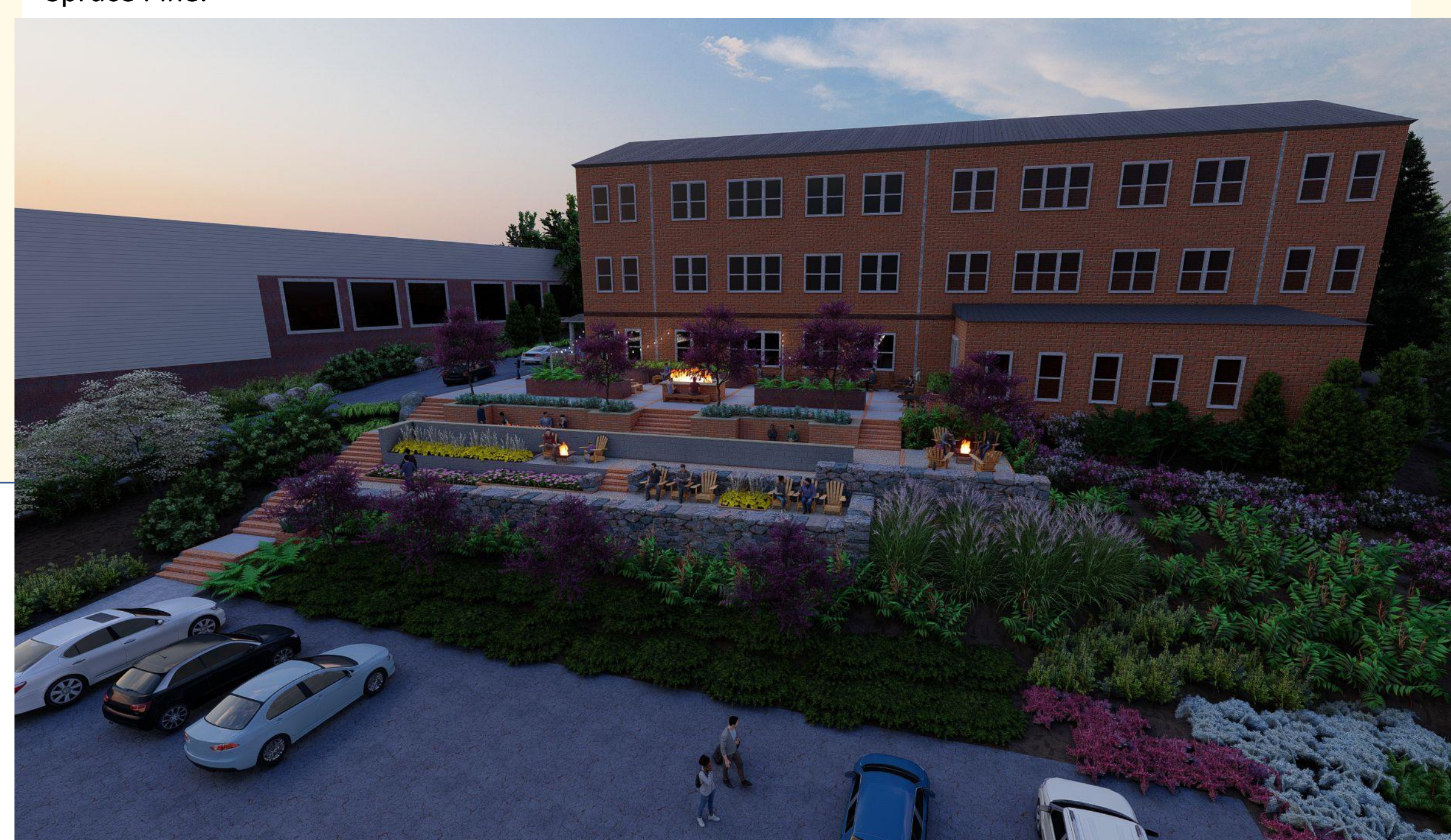
Rendering of landscaping at the Blue Ridge Boutique Hotel, located in downtown Spruce Pine, N.C.