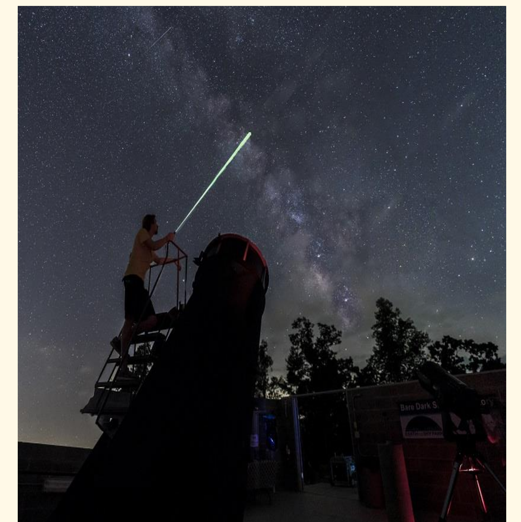
Visitors to the Bare Dark Sky Observatory at the Earth to Sky Park can have a two-hour stargazing experience looking through the Sam Scope, the largest public telescope in N.C.