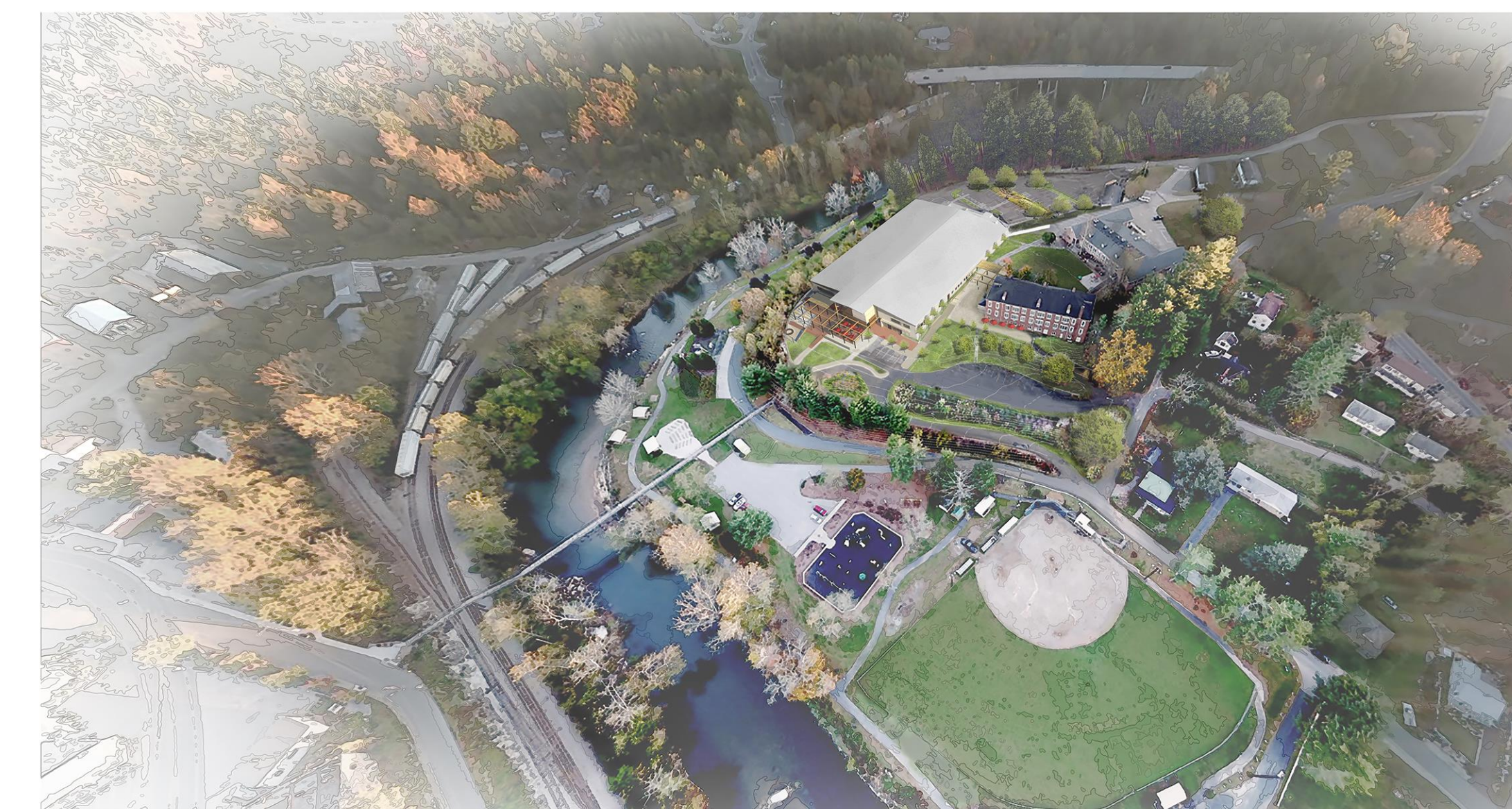
Aerial view of Three Peaks Enrichment Center, located in downtown Spruce Pine, N.C.