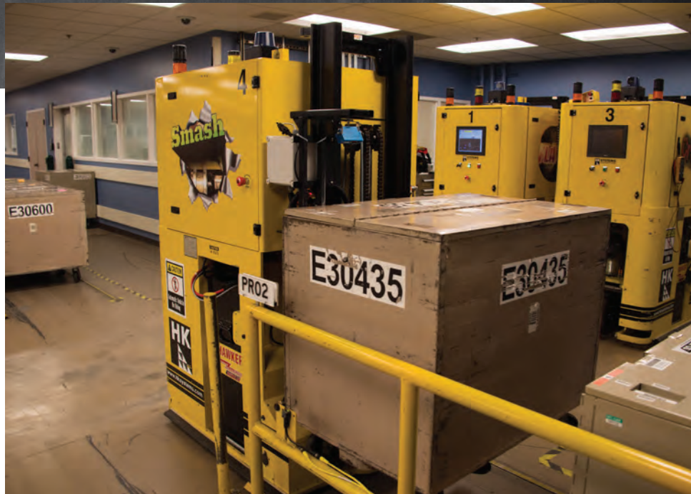
Smash, an automated vehicle in the Charlotte office's cash operation, does all the heavy lifting, while his mechanical coworkers, Flash and Crash, take a break in the background.