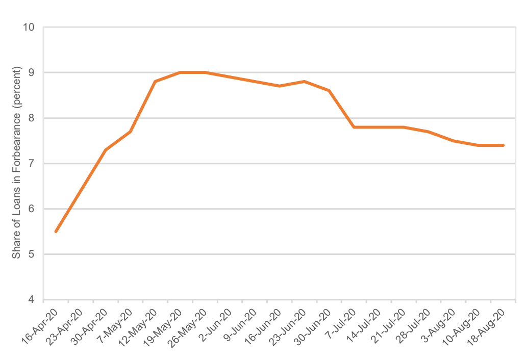
Figure 3: National Mortgage Forbearance Rate

Indications are that mortgage borrowers and servicers as a whole are weathering the storm better than expected. In mid-April, Black Knight announced that they would be tracking mortgages in forbearance through their McDash Flash Forbearance Tracker. As of August 18, 3.9 million homeowners were in forbearance. This represents 7.4 percent of all mortgages and $833 billion in unpaid principal balance. (See Figure 3.)16 These figures are down from the late-May peak of 4.76 million loans in forbearance — or 9.0 percent of all mortgages — representing over $1 trillion in unpaid principal. Although this may seem high, the forbearance uptake rate is lower than some expected, especially worst-case scenarios that put the expected rate near 30 percent.<sup>17</sup>