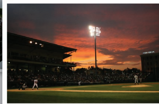
Fluor Field at the West End — Greenville, S.C.