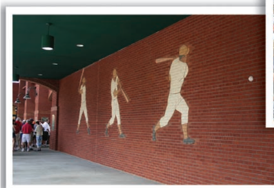
NewBridge Bank Park — Greensboro, N.C.

During Greensboro Grasshoppers games at NewBridge Bank Park, the team president's dog, "Miss Babe Ruth," delivers balls to the umpire and, on Thursday nights, fans gather for "Thirsty Thursdays" when beer costs as little as a dollar.