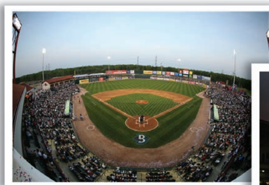
Regency Furniture Stadium — Waldorf, Md.