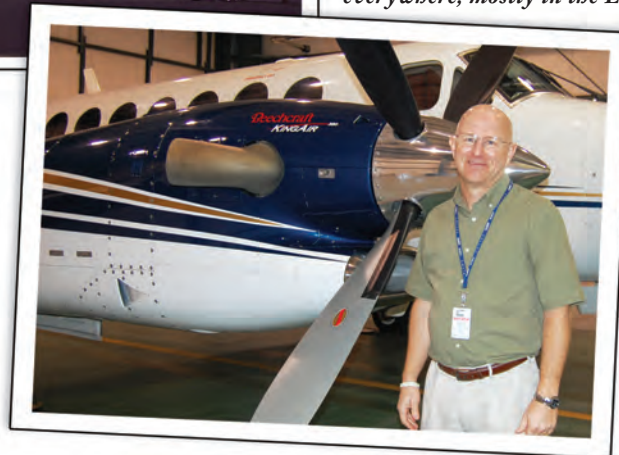
Capital Aviation Instruments & Avionics services and installs avionics at the Manassas Regional Airport. The 35-year-old firm also refurbishes aircraft.