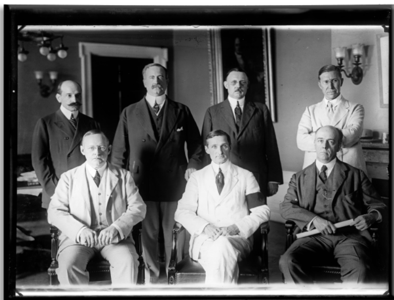
The members of the first Federal Reserve Board are sworn in on Aug. 10, 1914. Treasury Secretary William G. McAdoo is seated in the center of the front row.

The tool that would rescue America in 1914 would come from the previous banking crisis, the Panic of 1907. In October of that year, a loss of confidence in certain New York trusts prompted runs on those institutions. Trusts held assets for clients, like banks, but they were subject to fewer regulations and so were able to offer higher returns and engage in more speculative investments. The run on trusts quickly spread to banks and became a full-fledged panic. While a crisis sparked by trusts was new, banking panics in the United States were not: Between 1863 (when the National Banking Act was passed) and 1913 (when the Federal Reserve Act was passed), there were six major banking panics. The National Banking Act had replaced competing currencies issued by state-chartered banks with a national currency backed by government bonds. Prior to the Act, there were thousands of state bank notes in circulation, creating a nightmare for consumers to verify the value and authenticity of any currency used