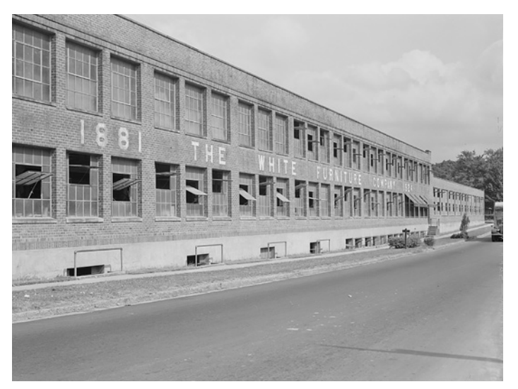
The White Furniture Company in Mebane, N.C., was organized in 1881. It was one of the earliest furniture manufacturers in the Piedmont region and remained in Mebane until the 1990s.

One of the story's wrinkles is that the influx of Chinese imports had not been initiated by Chinese industrialists but rather by the North Carolina industry's own leaders, who had sought cost advantages that could put them ahead in what has historically been, and remains to this day, a highly competitive industry. Another wrinkle is that, by undercutting North Carolina's furniture manufacturing base with Chinese imports, they were replicating a pattern that had played out during the 20th century, when