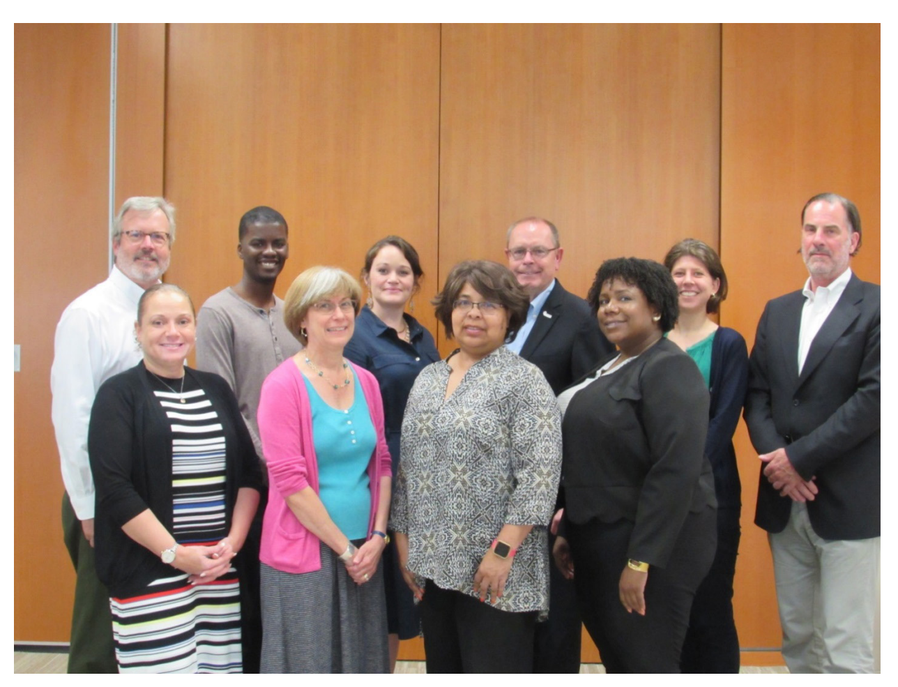
Members of the Detroit CDFI Coalition at a meeting in July 2018.

initiatives and concerns. The group also aimed to quantify and qualify the ways in which CDFIs are important to Detroit's development, and to elevate the visibility of CDFIs operating in Detroit. To this end, the group determined and publicized early on that they had collectively invested more than $1 billion in Detroit. A secondary early goal revolved around knowledge-sharing and strategic alignment as the member CDFIs sought to understand how their work fit into the city of Detroit's redevelopment priorities. Relationship-building was a third early goal of the group, particularly with the acknowledgement that both collaboration and competition are essential to the growth of a healthy and robust community development industry.