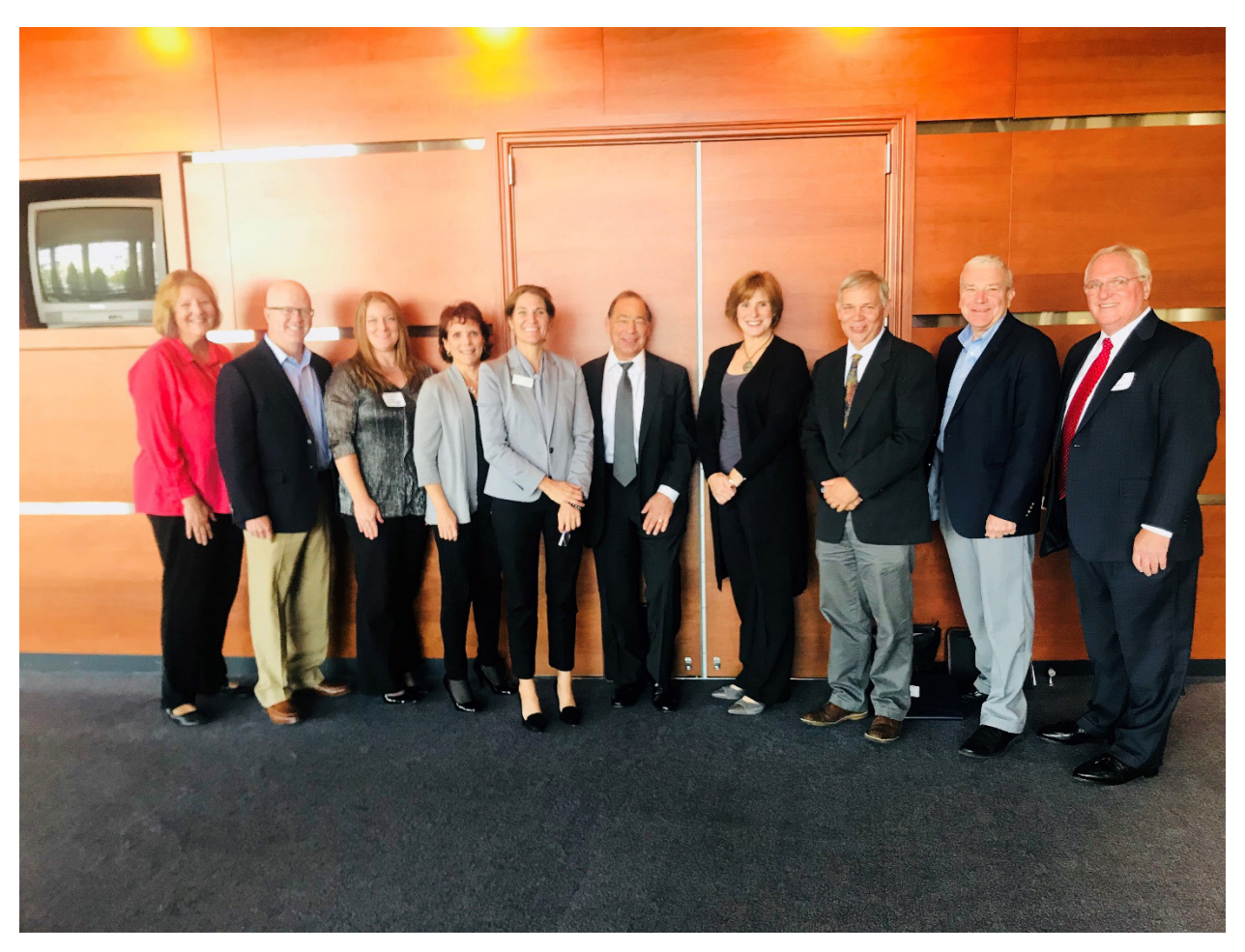
Members of the West Virginia Loan Fund Collaborative and staff from the Richmond Fed at a meeting in October 2018.

Understanding capital needs and default rates is also important. When the WVLFC was first analyzed, the members' pools of funds for loans ranged from less than $1 million to close to $10 million. At the time of the data collection in July 2014, the majority of the organizations still had funds available to lend. In addition, those funds that reported an overall default rate for their loans have default rates that are well below the national average rate of 12 percent estimated by SBA for its microloan program in 2007.