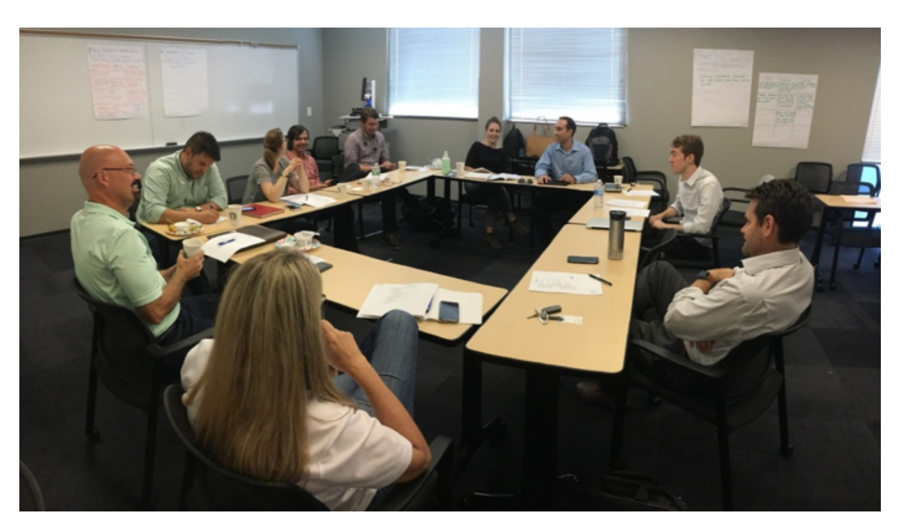
Members of the St. Louis CDFI Coalition and staff from the St. Louis Fed at a strategic planning meeting in 2017.