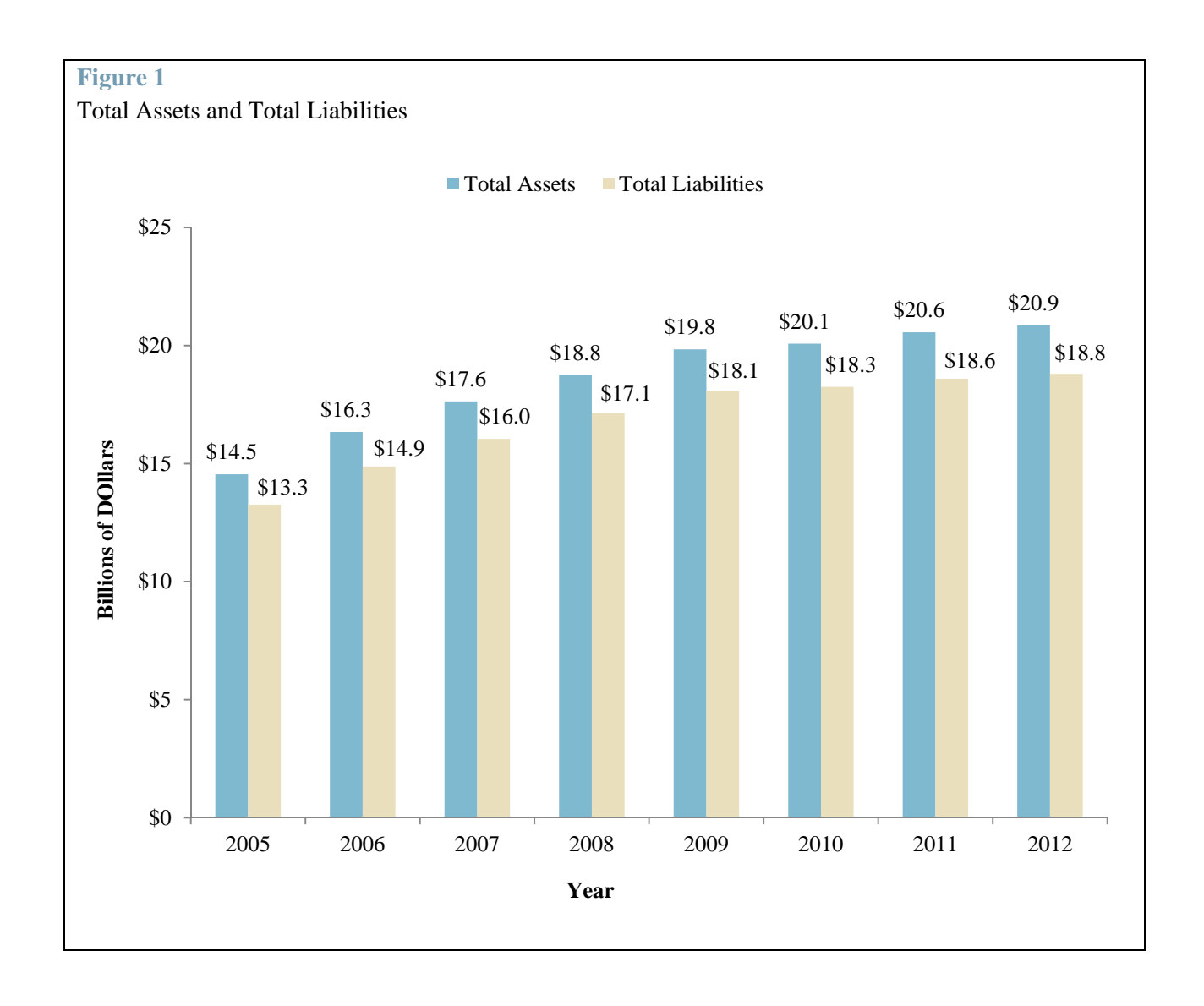
Figure 1 shows the total assets and liabilities of the CDB peer group. Total assets increased at a 5.3% average annual growth rate from $14.5 billion in 2005 to $20.9 billion in 2012. Over the same time period, total liabilities increased at a 5.1% average annual growth rate from $13.3 billion to $18.8 billion.