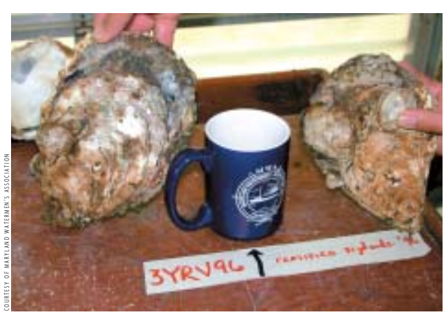
Compared to oysters native to the Chesapeake Bay, Suminoes grow faster and larger, and they are more resistant to disease.

Field and laboratory tests of Suminoe oysters by VIMS and the Virginia Seafood Council were far more successful. The nonnative organism grew to market size two to four times faster than native oysters and resisted MSX and dermo. And the meaty oyster tasted good. This excited aquaculture firms, commercial fishermen, and government officials in bay communities looking to improve the regional economy.