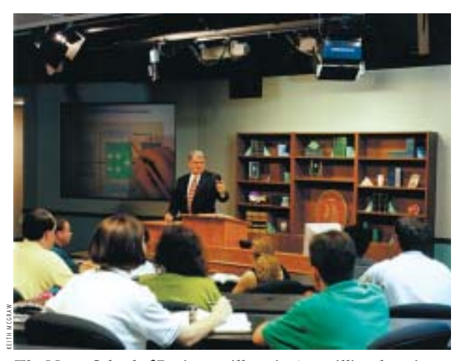
The Moore School of Business will use its $45 million donation to expand programs such as its Professional MBA, which offers instruction at multiple classrooms via satellite.

Her money will be combined with matching funds from the USC Board of Trustees and donations raised over the next few years to upgrade the business school's decades-old facilities. It will