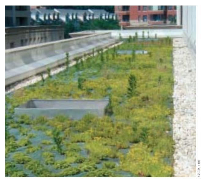
Completed in October 2003, this retrofit living roof atop the Arlington County Government Center is filling in quickly. The county also plans to top a community center and a fire station with sections of vegetative roofing.