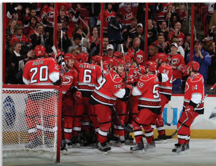
The Hurricanes celebrate after a 4-3 overtime victory over the Atlanta Thrashers in January 2011.