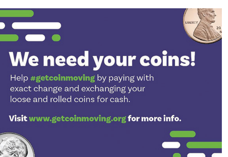
The Get Coin Moving campaign was part of a toolkit created by the U.S. Coin Task Force for retailers and financial institutions.

Banks were being stingy with coins for a reason. They themselves were facing supply constraints on coins coming from the Federal Reserve, which distributes cash to depository institutions. In June, the Fed announced that it had started rationing pennies, nickels, dimes, and quarters to "ensure a fair and equitable distribution of