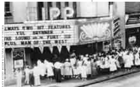
In addition to showing feature-length films, Richmond's Hippodrome Theatre showcased Cab Calloway, Nat King Cole, Billie Holliday, Lena Horne, and other black performers.

It was common for slaveholders to profit from hiring out their laborers. Some slaves recognized their value on the open market and asked to negotiate the terms of their self-employment. Occasionally, they went a step further and asked for permission to run a business. Owners usually acquiesced when they got a cut of the take.