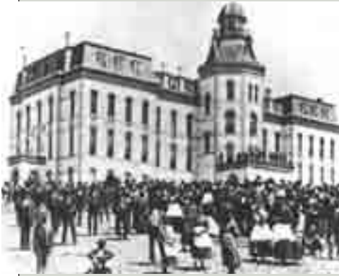
Howard University was the center of black business and cultural activity in Washington, D.C., following the Civil War.