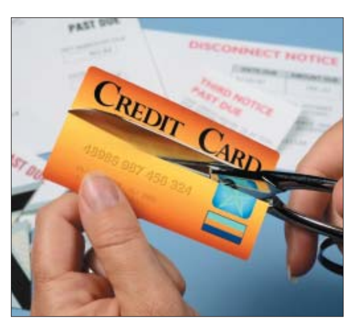
Mounting consumer debt spawned big increases in bankruptcy rates during the 1990s. A Richmond Fed economist suggests that widely available credit — more so than falling stigma — was the driver behind the gains.