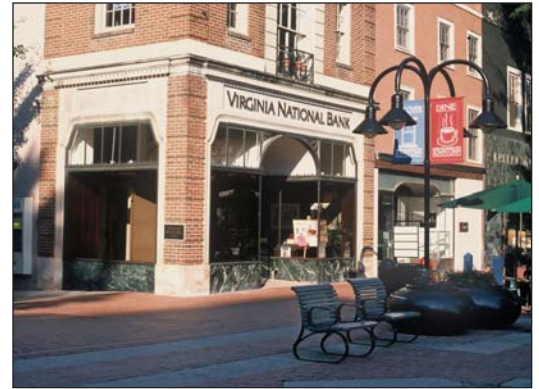
Virginia National Bank entered the Charlottesville market shortly before Albemarle First.