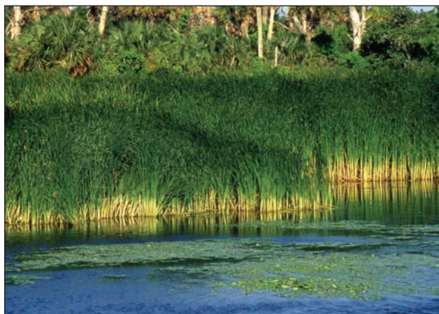
Linking pre-existing conserved areas, like South Carolina's Waccamaw National Wildlife Refuge (pictured here), with the land acquired from International Paper will better benefit waterfowl and protect water quality.