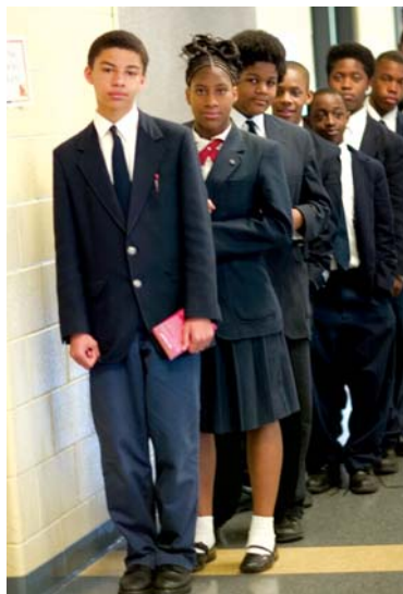
Schools that rely on voucher students for the majority of their enrollment have sprouted up across Milwaukee since the inception of the city's pioneering program in 1990. Two of the most admired are Notre Dame Middle School (left), an all-girl campus whose famed whiteboard keeps tabs on all of its graduates; and St. Marcus Lutheran (right), which has seen enrollment triple over the past five years with its "tough love" approach to education.