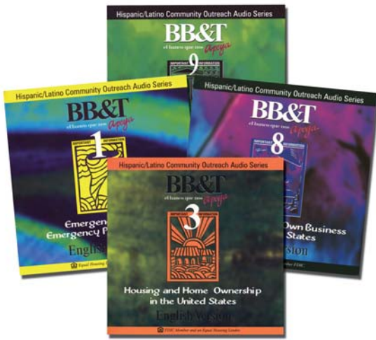
Reaching the unbanked: Audio series like these teach immigrants about life in the United States, including its banking system.

mortgages if they applied for them. Their fears may not be unfounded. Relatively few banks make loans based on a foreign national's Individual Taxpayer Identification Number (ITIN) — in this case, a Social Security Number is usually required — although that number is growing. Banks may be reluctant to lend to undocumented borrowers because ITIN mortgage loans will likely be difficult to sell in the secondary market.