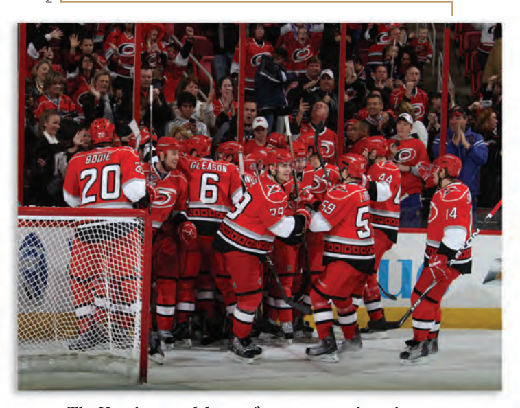
The Hurricanes celebrate after a 4-3 overtime victory over the Atlanta Thrashers in January 2011.

The NHL began its expansion into the South in the