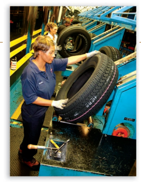
Workers inspect tires at Bridgestone's Aiken County plant.

Incentives may have steered these latest expansions to South