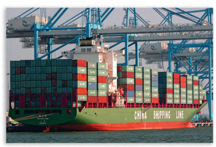
A vessel loaded with containers arrives at Norfolk's port.

Of the major container cargo ports in the Southeast, currently only Virginia's Norfolk International Terminals can accommodate "post-Panamax" vessels which carry more than twice the container volume as those that can currently squeeze through the Panama Canal — in all tidal conditions. The majority of goods that come through Norfolk's port, however, are shipped to the Midwest and Upper Midwest, leaving no