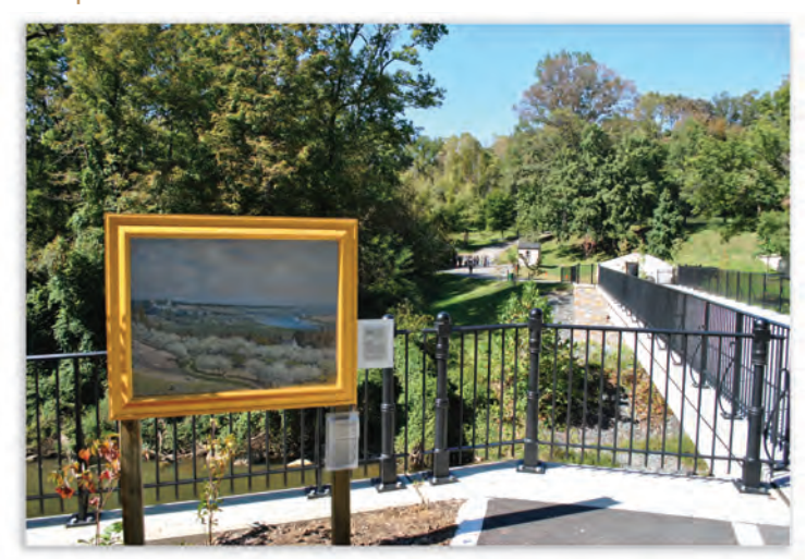
The Walters Art Museum placed reproductions of paintings around the city, including "The Terrace at St. Germain," located at Robert E. Lee Park.

The Walters Art Museum in Baltimore is showing 25 reproductions of its paintings in unexpected places — outdoors. At the Maryland Zoo, "Syria, the Night Watch," a depiction of lions prowling the ruins of a once-great city, is installed near the big cats' habitat. The painting "Art and Liberty," a portrait of an itinerant violinist, went outside the Peabody Institute of Johns