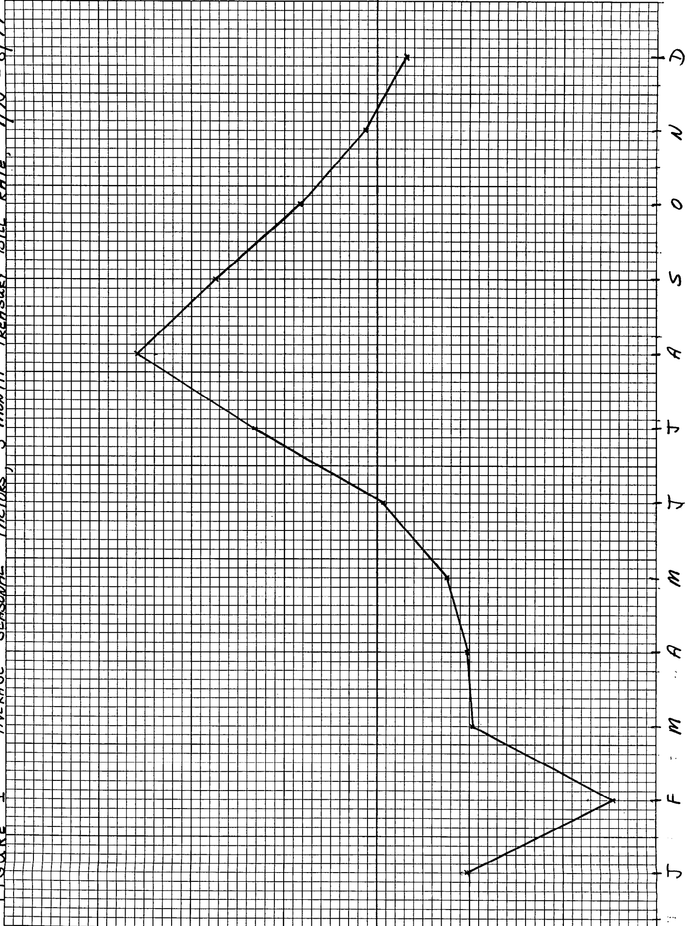
FIGURE 1 AVERAGE SEASONAL FACTORS, 3-MONTH TREASURY BILL RATE, 9/70 - 8/77